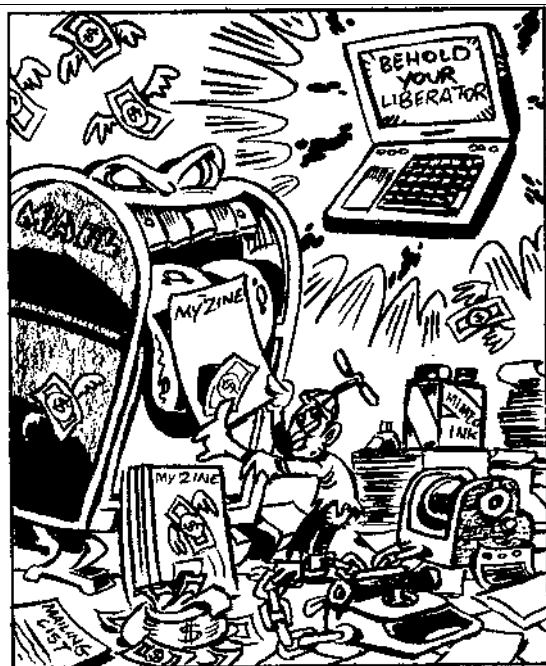
The FAN-ED'S SALVATION