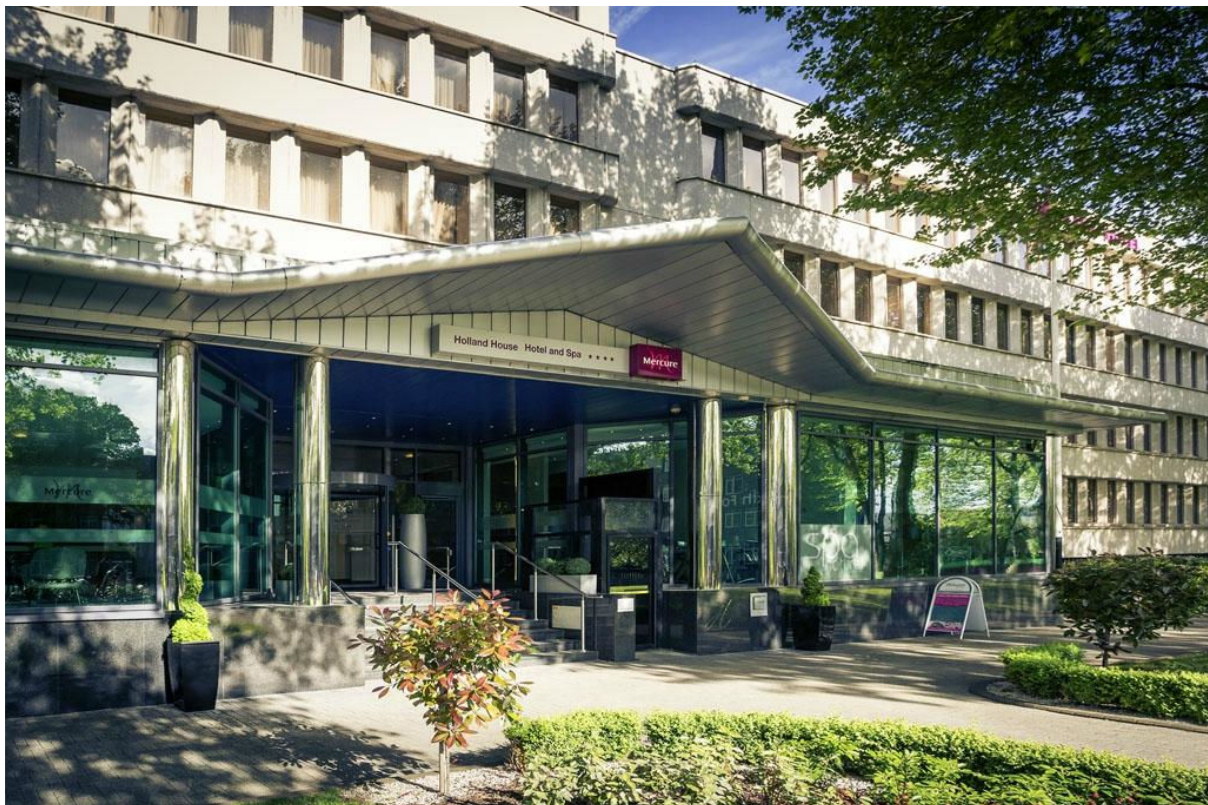
The Mercure Holland House Hotel, Redcliffe Hill, Bristol BS1 6SQ